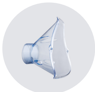
MASCHERA PEDIATRICA CHILD MASK