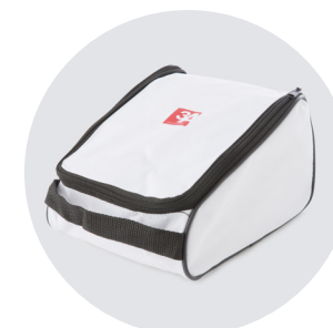
BORSA CARRYING CASE