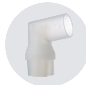
RACCORDO ACCESSORI ACCESSORIE'S CONNECTOR