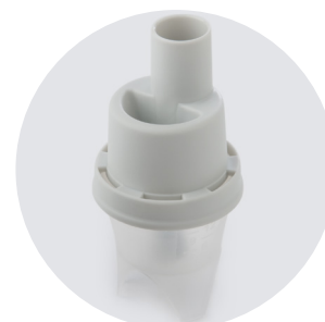
AMPOLLA NEBJET NEBJET NEBULIZER