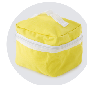
BORSA CARRYING CASE