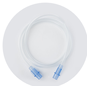
TUBO ARIA AIR TUBE