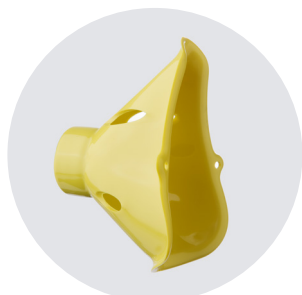
MASCHERA PEDIATRICA CHILD MASK