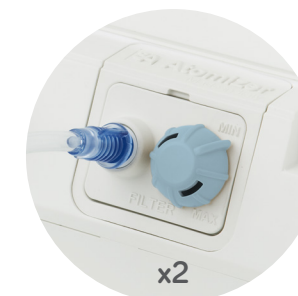
2 VELOCITÀ 2 SPEEDS