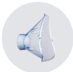
MASCHERA PEDIATRICA CHILD MASK